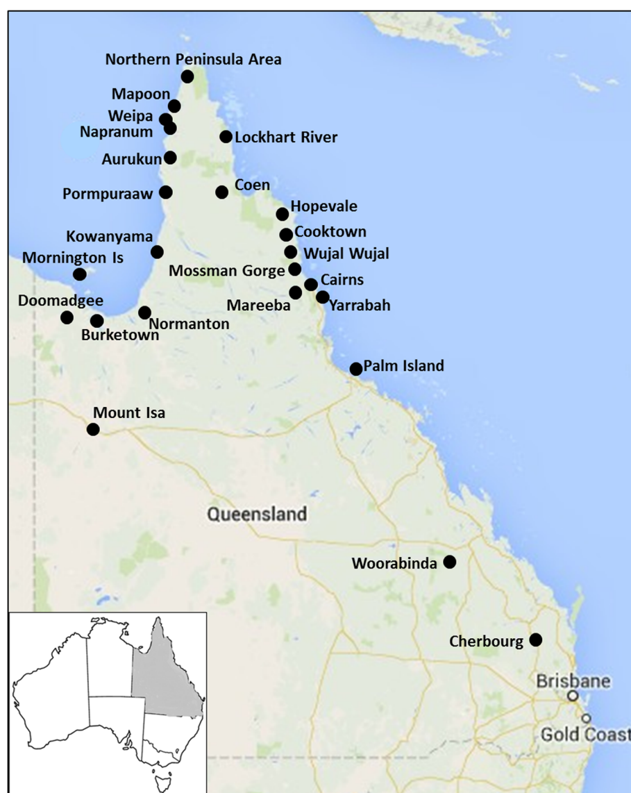
Figure 1 Indigenous communities and towns in Queensland affected by Alcohol Management Plans.

Additional people can be employed on a casual basis during visits to discrete communities; these community members act as local facilitators within the community. The majority of staff members have prior experience and qualifications working with Indigenous community members or in remote Indigenous communities in Queensland and in other Australian jurisdictions.